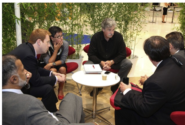
Figure 2 Round table discussions at ESC.

related topics. Thus, a village may include presentations in one room on heart failure and in an adjacent room on heart rhythm disturbances. Through the village concept the congress becomes more manageable and interactive. Important new guidelines will be presented at the ESC Congress 2013 on arterial hypertension, cardiac pacing, diabetes, and stable coronary artery disease. Linked to these will be dedicated scientific sessions, case based Focus Sessions.