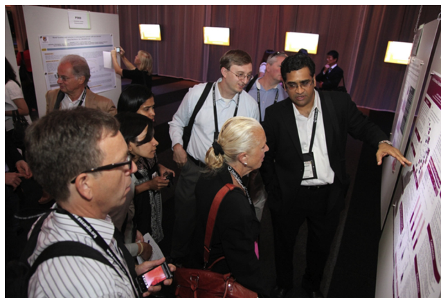
Figure 1 Discussions around a poster at ESC Congress.

There is huge and international enthusiasm for participation in the congress with a record number of submissions for scientific planned sessions (more than 400 were selected) and the second highest ever number of abstracts were submitted (10,490). To make the congress more manageable we have again arranged the congress into “villages” of